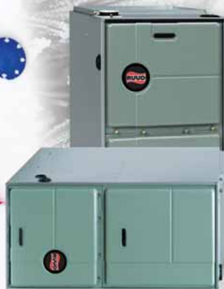
Model RGRM Upflow - 95% Efficiency

Premium 95% AFUE Two-Stage Gas Furnace with Dual Comfort Control ™